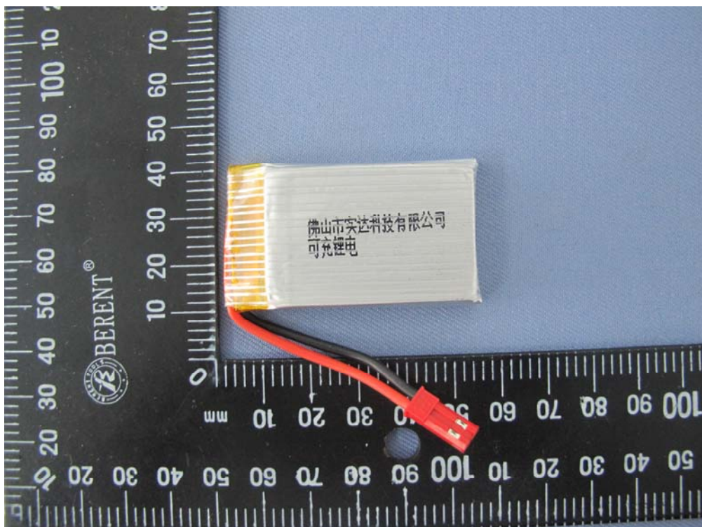
Figure 2 Bottom view of battery